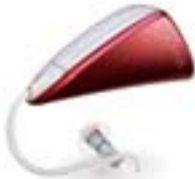
Delta Cabernet Red

And Delta's performance more than matches its good looks. Using highly advanced digital sound processing technologies, Delta makes thousands of adjustments per second to reduce noise and enhance speech.