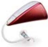
Delta Cabernet Red

And Delta's performance more than matches its good looks. Using highly advanced digital sound processing technologies, Delta makes thousands of adjustments per second to reduce noise and enhance speech.