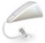
Mother of Pearl