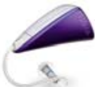
Delta Deep Purple