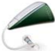
Delta Racing Green