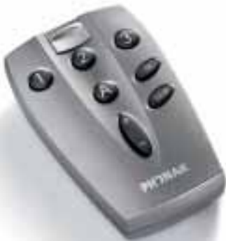
SoundPilot – is a handy remote control, ergonomically designed and easy to use.

remains audible. The benefit for you is comfortable communication in every social situation. The ultimate solution for hearing in noise is the use of wireless technology, also known as FM. The latest FM systems from Phonak, used with Supero, represent an unbeatable communication package. A special, highly miniaturized FM receiver simply clicks onto the Supero instrument. A transmitter/microphone (hand held or given to the speaker) picks-up speech and transmits it directly to the hearing instrument. The effect is the equivalent of speaking directly into the ear. FM systems overcome the obstacles of noise,