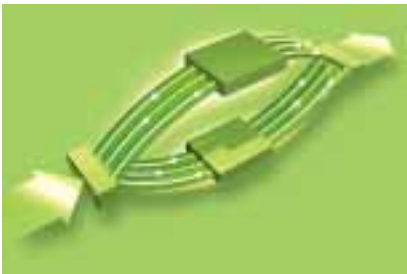
The Supero chip is specially designed for power applications.

High-tech digital technology is only the starting point – its intelligent implementation into an effective communication system is what really counts. For Supero, Phonak has created a digital chip that was designed specifically to make the most of your hearing, however limited. The result is the effective amplification of a wider range of sounds, providing optimum audibility. Supero is configured to meet your individual needs and tastes, using the latest expert fitting software. You are unique – so is every Supero hearing instrument.