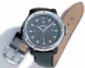
WatchPilot – for discreet and convenient operation of your Supero – by remote-control.