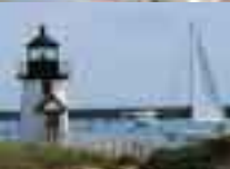
Cape Cod Duo